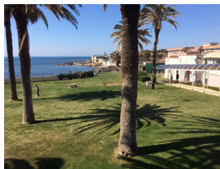
Pediatric Ocular Oncology outpatients department, Bambino Gesù Pediatric Hospital, Santa Marinella

This meeting aims to enhance the clinical and preclinical knowledge of Retinoblastoma through advanced discussion amongst the experts in this field. In particular we propose an update on molecular biology, diagnosis, conservative and non conservative Retinoblastoma management, radiological guidelines,